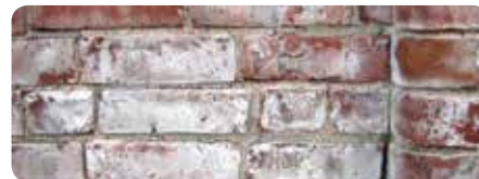
Masonry surface: Brick walls/concrete slabs subjected to damage from moisture/efflorescence