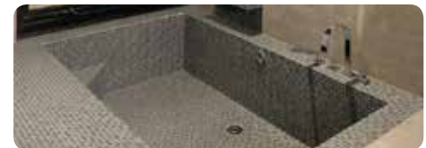
Waterproofing of sunken areas: Bathrooms, toilets, balconies etc.